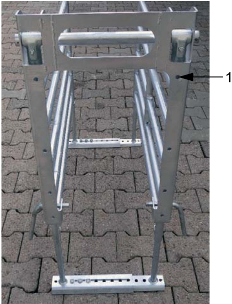
1 Hole template for attachment

Note: If the stall partition is attached to the feeding fence via the swivel frame, there is no need to fit the front feet.